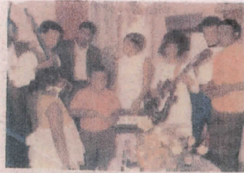
Gibson Family of Gospel Singers at a Rehearsal