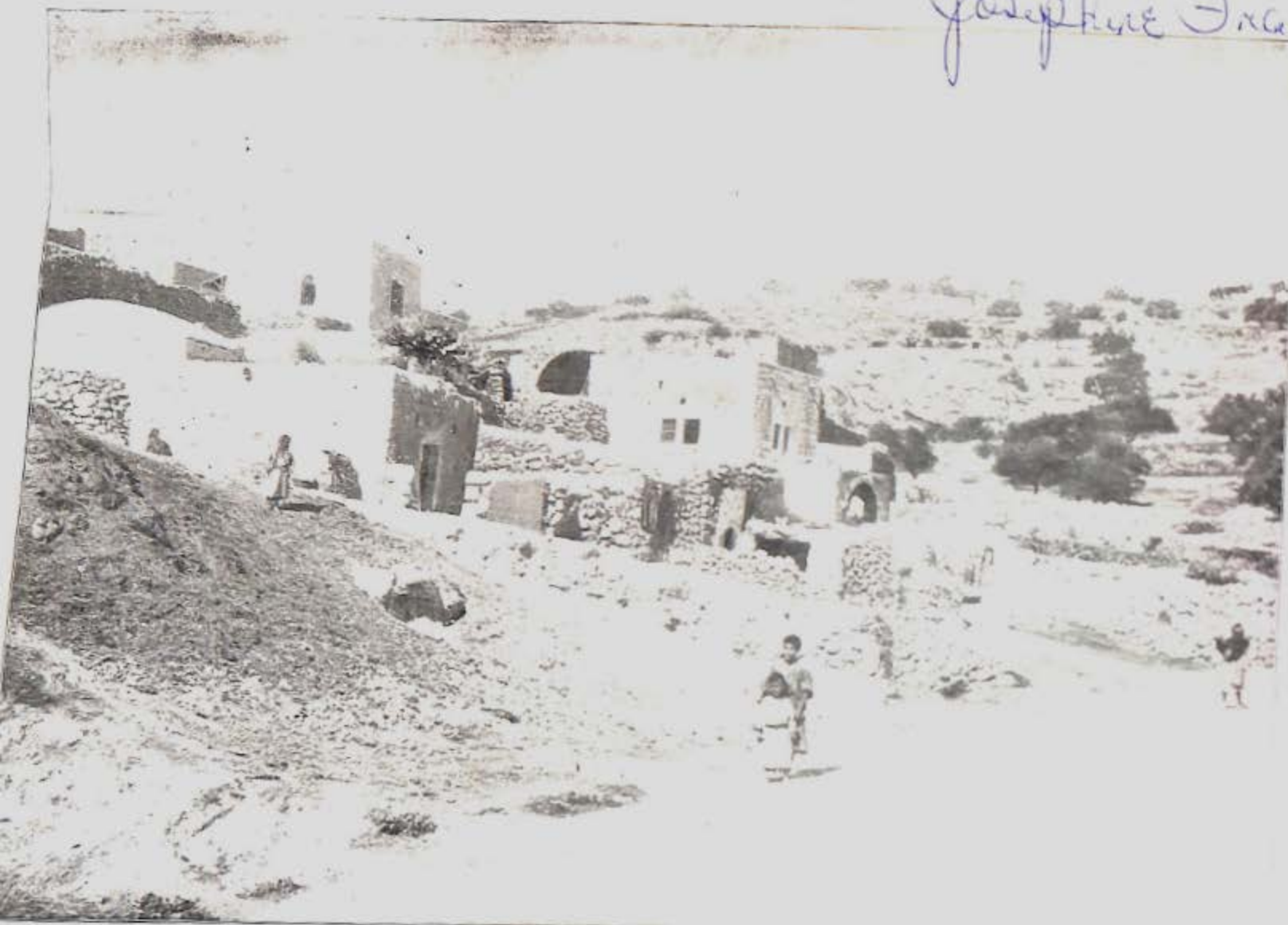
VIEW OF BETHANY.—The village of Bethany is easily reached from Jerusalem. The flight of steps on the east side of the Temple, before the Golden Gate, led to the quiet village of the Kidron, and after rather more than half an hour's journey Bethany comes into sight. The ruins of a tower rise now over the highest point of the village, but these remains are of later date than the days of our Lord. The white-washed and flat-roofed houses of Bethany lie half hidden in the green fields and trees among the surrounding heights.