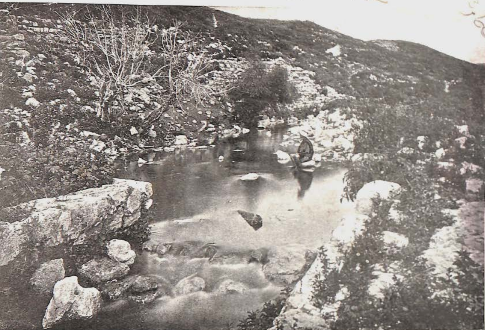
'AIN-ES-SULTAN, OR FOUNTAIN OF ELISHA.—Modern Jericho really consists of a group of poor houses inhabited by about 300 persons. From this village one may take an evening walk to the 'Ain-es-Sultan, by which Jericho was once supplied with water. This "Sultan's Spring," which is shown here wells forth copiously from the earth, and is collected in a small pond. This is undoubtedly the spring of water which Elisha healed with salt (II Kings 11, 19, 22).